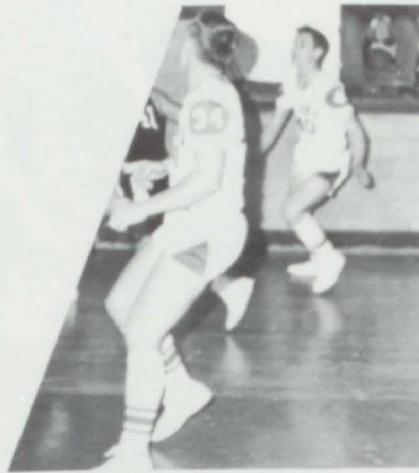
"We're watching it!!"