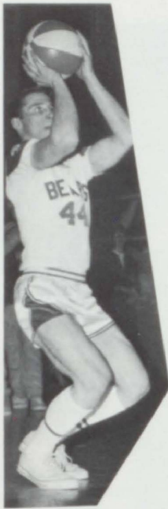
"This one's gonna be right in the bucket!!"