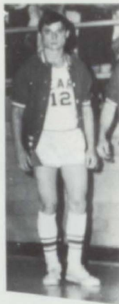
"Coach, I think I'm scared!"