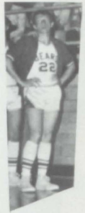
"Aw, come on I want a turn."